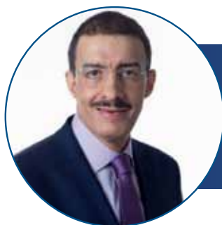
H.E. Dr. Bandar M. H. Hajjar President, IsDB and Chairman, Board of Executive Directors