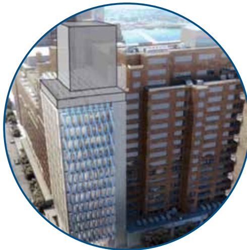
Concept Design of Students Dormitory Project New York – USA

The idea of establishing an Awqaf Capital Fund (ACAP) is also envisioned. This Fund will provide a global investment platform for Waqf donors, charity organizations and investors and will generate income that will be used in the field of socio-economic development.