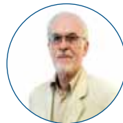
Hon. Abdolrahman Nadimi Boushehri