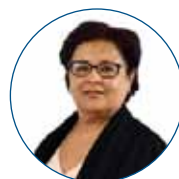
Hon. Faouzia Zaaboul