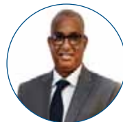
Hon. Diao Balde