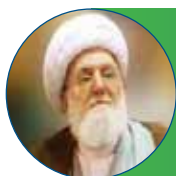
His Eminence Ayatollah Shaikh Mohammad Ali Taskhiri Member