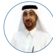
Hon. Bader Ahmed Al Qayed