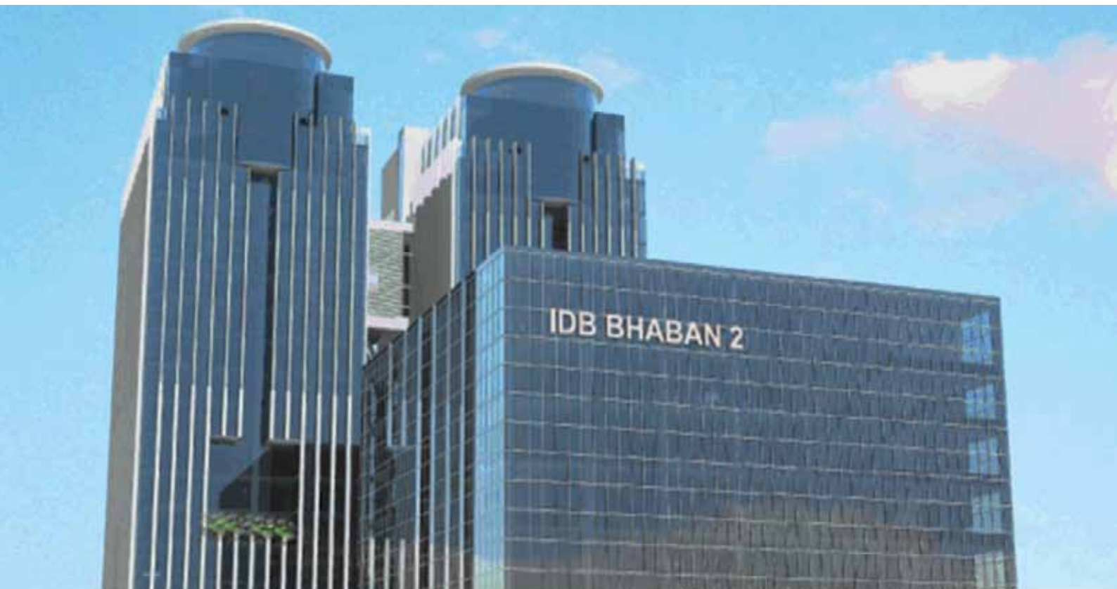
Concept Design of a Commercial Waqf Building Dhaka - Bangladesh

As such, the GOE Department is involved in conducting post-evaluation of APIF operations and communicates evaluation results and impact of APIF interventions, identifies lacking areas/ gaps and lessons learned, and makes recommendations to the Management for improvements, as required, towards achieving the targeted goals with quality and efficiency.