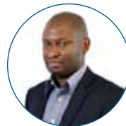
Hon. Aboulie Jallow