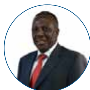
Hon. Fredrick Tabura Twesiime