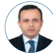
Hon. Bulent Aksu