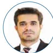
Hon. Zahid Ullah Hamdard