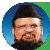
His Eminence Shaikh Muhammad Taqi Usmani Member