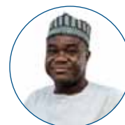
Hon. Mohammed Gambo Shuaibu