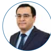
Hon. Bakhodir Alikhanov