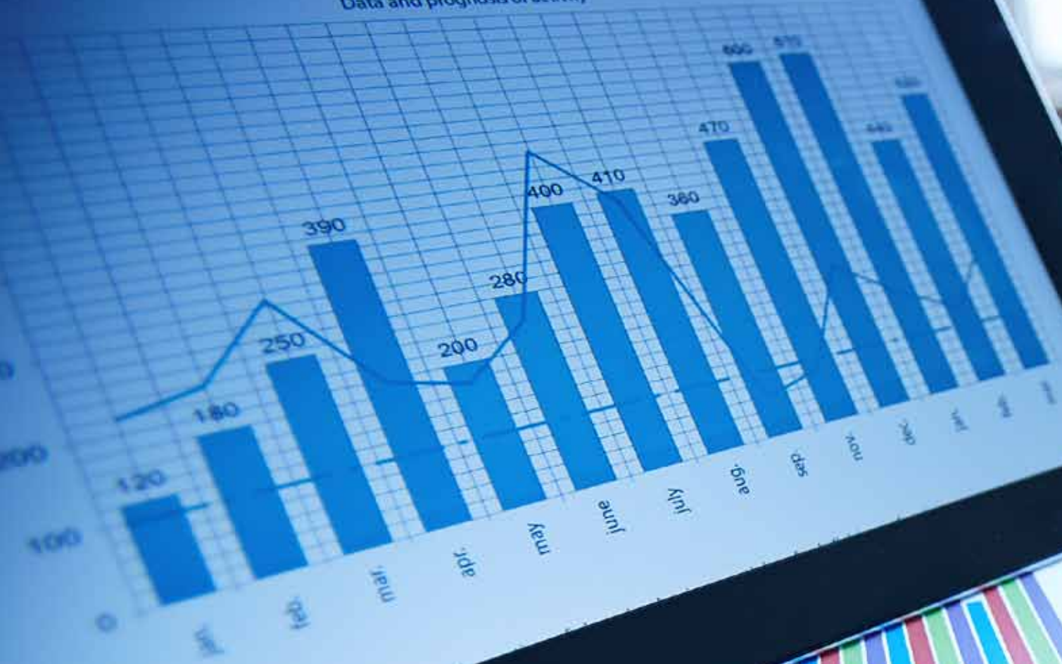
Data and prognosis of activity